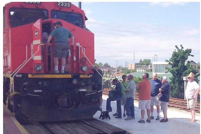
Touring CN locomotive on National Train Day

Sometime between 8:00 AM and 10:00 AM the CN will arrive with their locomotive as well as locomotives from other Memphis railroads (still not finalized) for display. As in the past, the CN locomotive cab will be open for a walk through tour with knowledgeable CN employees explaining how things work. Thank you CN!