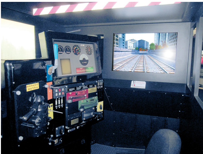
Inside the Norfolk Southern Exhibit Car

The Norfolk Southern Exhibit Car will also open at noon and will be open to everyone. Admission to both exhibits is FREE and will remain open until 5:00PM.