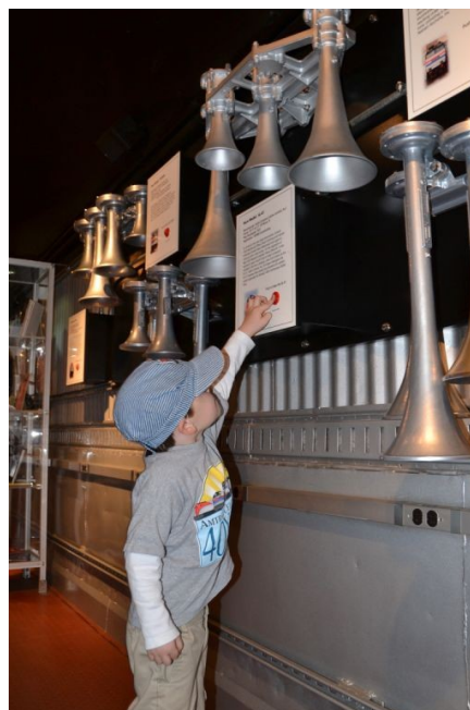
Inside the Amtrak Exhibit Train

On Friday, October 3 rd the museum and gift shop will be open usual hours, 10:00 AM 'til 5:00 PM. Regular admission charges to the museum will apply. At noon the Amtrak Exhibit Train will open to the public and for school and other groups. If you have a group that