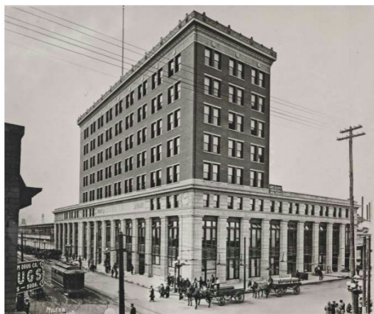
A Generously Illustrated History of Central Station