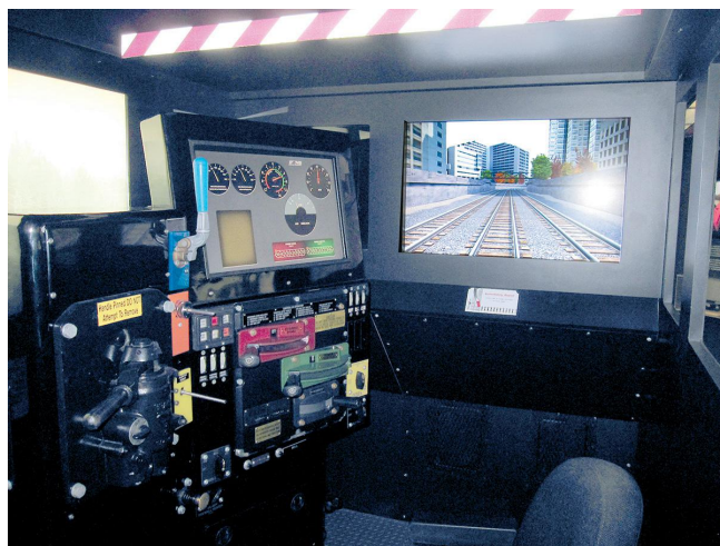
Interior of train simulator in NS Railroad's Exhibition Car. Control stand is the device on the left with all the levers and buttons.

Once we get the thing up a running we will need people man the simulator, setting up the activities and showing visitors how to run it. Again, if interested email us at contractus@mrtm.org