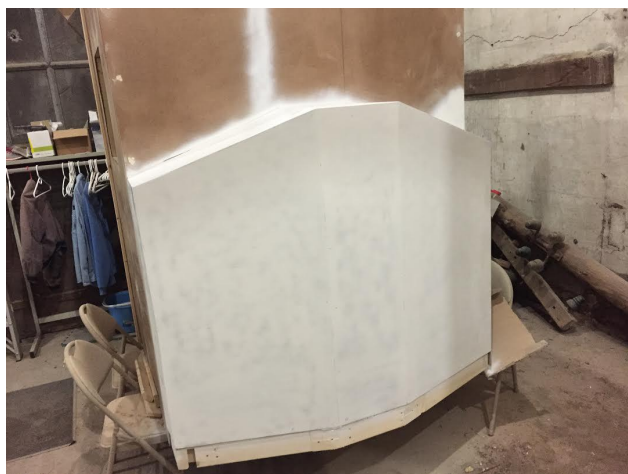
Conceptual drawing (top) and actual simulator under construction (bottom)

Work is well underway on a train simulator that will allow museum visitors to drive a virtual train in a mock up locomotive cab. It is our objective to have it ready for Amtrak Train Day. Based on Microsoft Train Simulator, the engineer will drive the train using a control panel while seeing the road ahead on a wide screen TV.